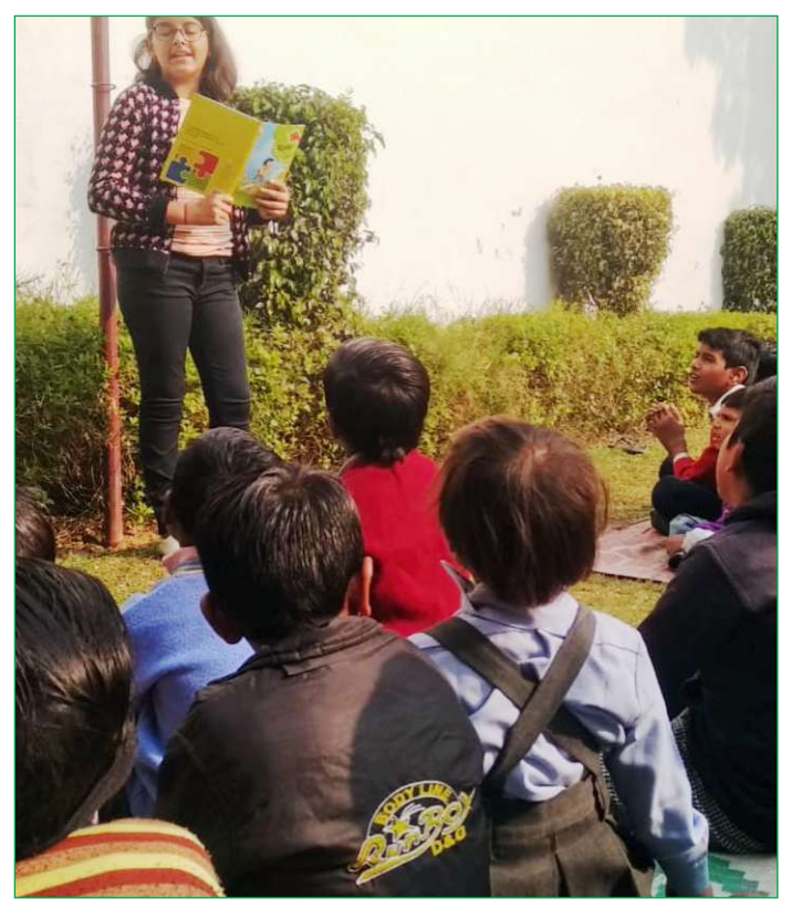
Community Library Project with DPS, Greater Faridabad