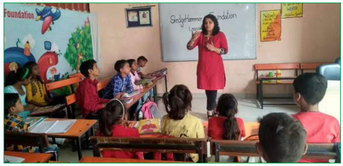
Community Library project with DPS, Greater Faridabad