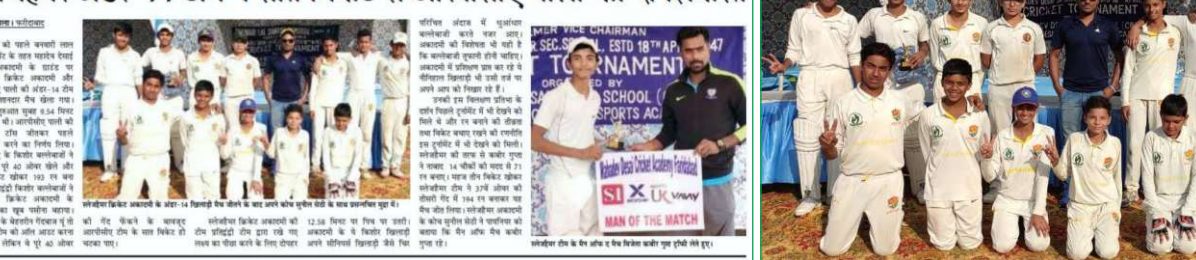
Achievement of U-14 Team at SHCA