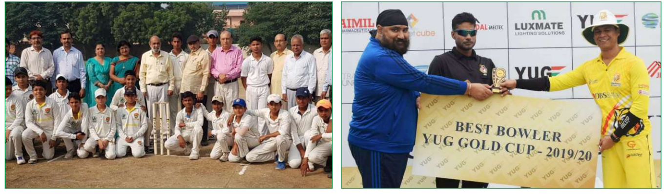
U14 Cricket Team