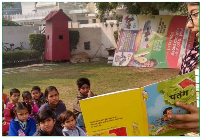
Community Library Project with DPS, Greater Faridabad