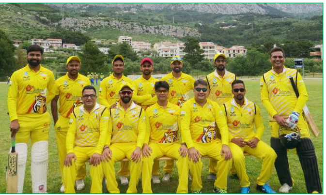
Finalist, Mediterranean Cricket League, Croatia, 2019